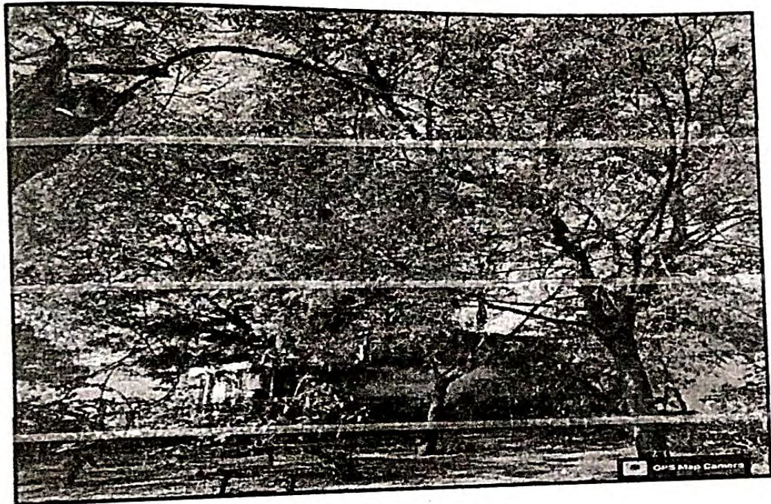
Plant biodiversity at the Campus

Audit Observation: To understand the plant biodiversity of the campus, the college has been conducting a census of trees, herbs and shrubs every five years. As per a recent survey (2019), the college campus has rich plant biodiversity including species with a dominance of family Fabiaceae . With regard to trees, the dominance of Dalbergia Sissoo is recorded. Due to recent construction activities in the college campus, the number of trees was found to be decreased, hence tree plantation efforts were made in association with NSS and Sport units. Recently, about 30 trees including Pongamia pinnata and Azadirachta indica were planted to keep the campus green.