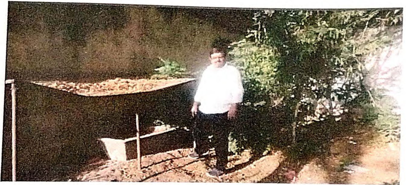
Virmi Compost pit