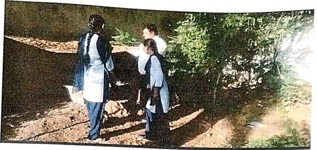
Virmi Compost pit